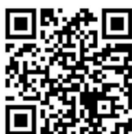
For cashless donations, please scan QR Code

For the 'DAY OF THE UNBORN CHILD' appeal to be held on the 11 th & 12 th February 2023