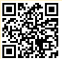
For cashless donations, please scan QR Code

For the 'DAY OF THE UNBORN CHILD' appeal to be held on the 11 th & 12 th February 2023